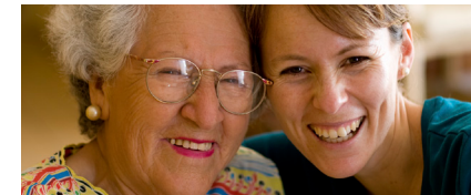
You Only Want the Best for Them