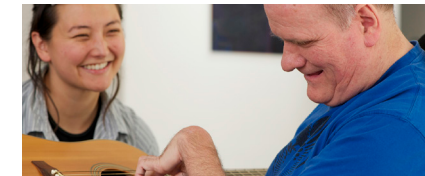
Living Life to the Fullest