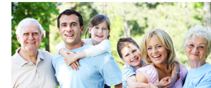
Generations of Care